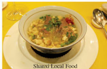
Shanxi Local Food

The Initial understanding of China course is delivered one week before the opening of the MBA. The program takes students to important business and cultural sites in several Chinese cities, and helps students integrate with BiMBA alumni, most of whom hold senior positions in business organizations. This orientation course gives participants a sense of what lies beyond their current backgrounds, preparing them to merge into the Chinese business world and the cultural environment proactively, in order to gain effective understanding of the Chinese way of thinking. This course prepares students to get used to life in China and be ready for MBA study in the Chinese environment.