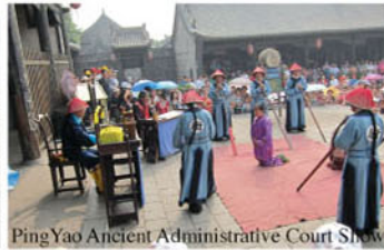
Pingyao Ancient Administrative Court Show