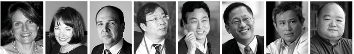
International faculty: professors, lecturers and guest speakers from all over the world.