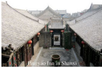
Pingyao Inn in Shanxi

Approximately 30%-40% of the full-time MBA students are international from different parts of the world. Students believe the most valuable part of their study at BiMBA is value added through in-depth understanding of China. BiMBA has developed its unique and innovative "Understand China" courses that are specifically for its international students. These courses are designed to familiarize the students with Chinese competitiveness in the global business environment. This significantly enhances their market value.