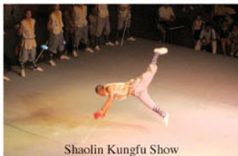
Shaolin Kungfu Show